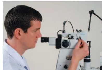
The YC-GYC changeover lever

Space requirements are minimized, and the combination adapter (optional) includes a split mirror illumination tower.