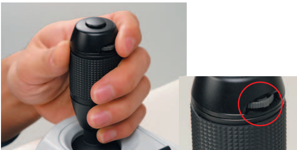
Unique Joystick "S-switch"

The "S-switch" on the joystick provides easy changes to treatment settings while maintaining alignment on the region being treated. The convenience of not looking away from the oculars during treatment and ease of use allow surgeons an increased level of comfort during treatment.